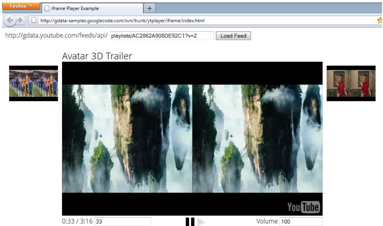
Figure 3. Sample iframe-based YouTube Video Player with 3D Video Feed