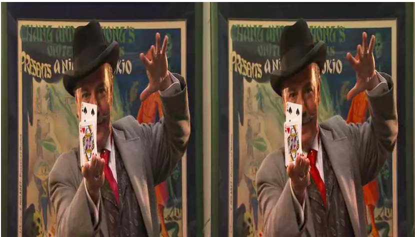
Figure 2. Sample of a Left-Right image.

A sample 3D screenshot is shown in Figure 2.